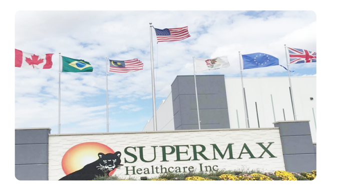
Wednesday, February 10, 2021 Supermax halts operations at Meru plant for 3 days