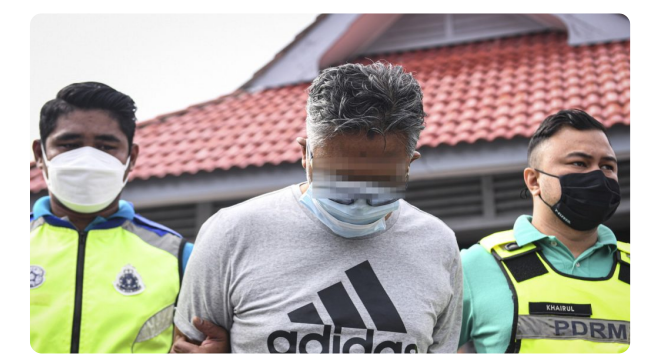
Friday, January 14, 2022 Doctor in fake vaccine cert case remanded again