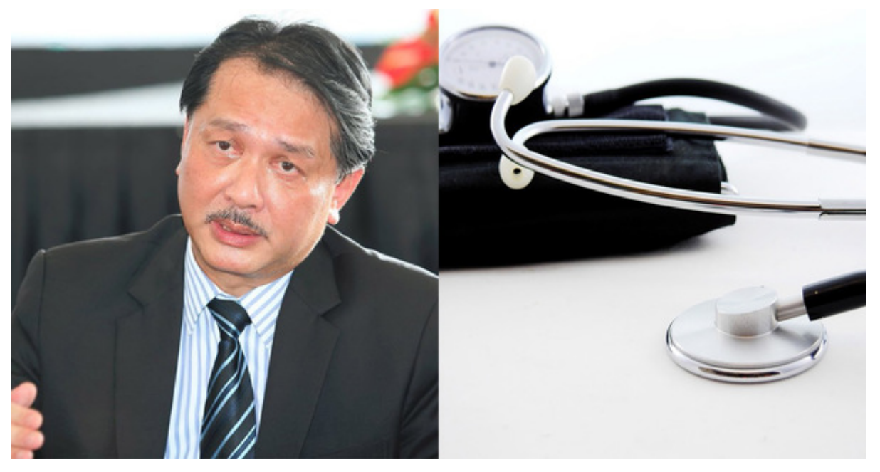
MOH Warns Of 3 Types Of Fake Doctors. Here's How To Check If Your Doctor Is Legit