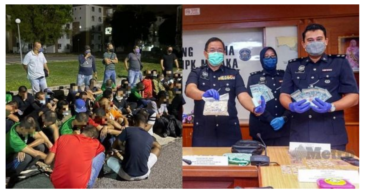
3-Day Drug Den Crackdown Sees Over 5,200 Arrested Including Dozens Of Teen Drug Peddlers