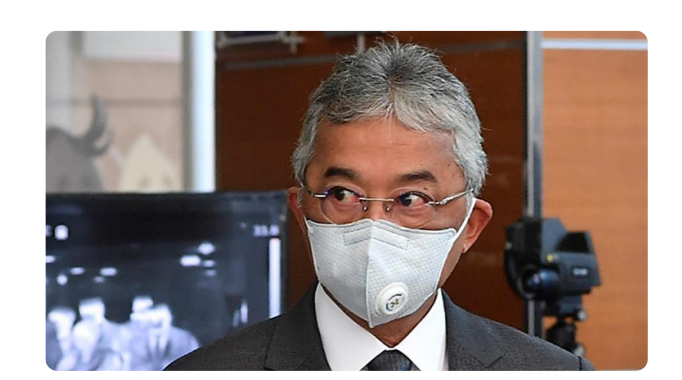
Wednesday, July 1, 2020 King urges Malaysians to comply with COVID-19 guidelines