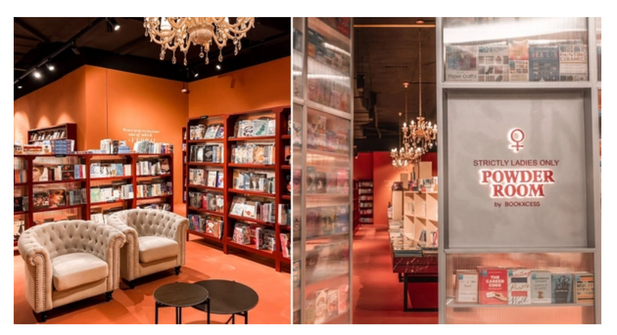
This KL Mall Has A Women-Only 'Powder Room' If You Need A Break From Men