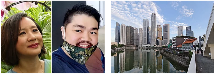
Anti-vaccine group founder, doctor in Singapore charged with...