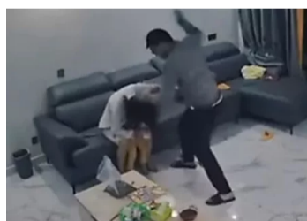
Man in China removed from deputy manager job after clip of him abusing...