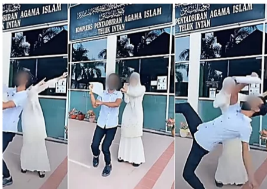
[Watch] Perak Couple Does Happy TikTok Dance After Getting Divorce, But Netizens Are Unhappy About It