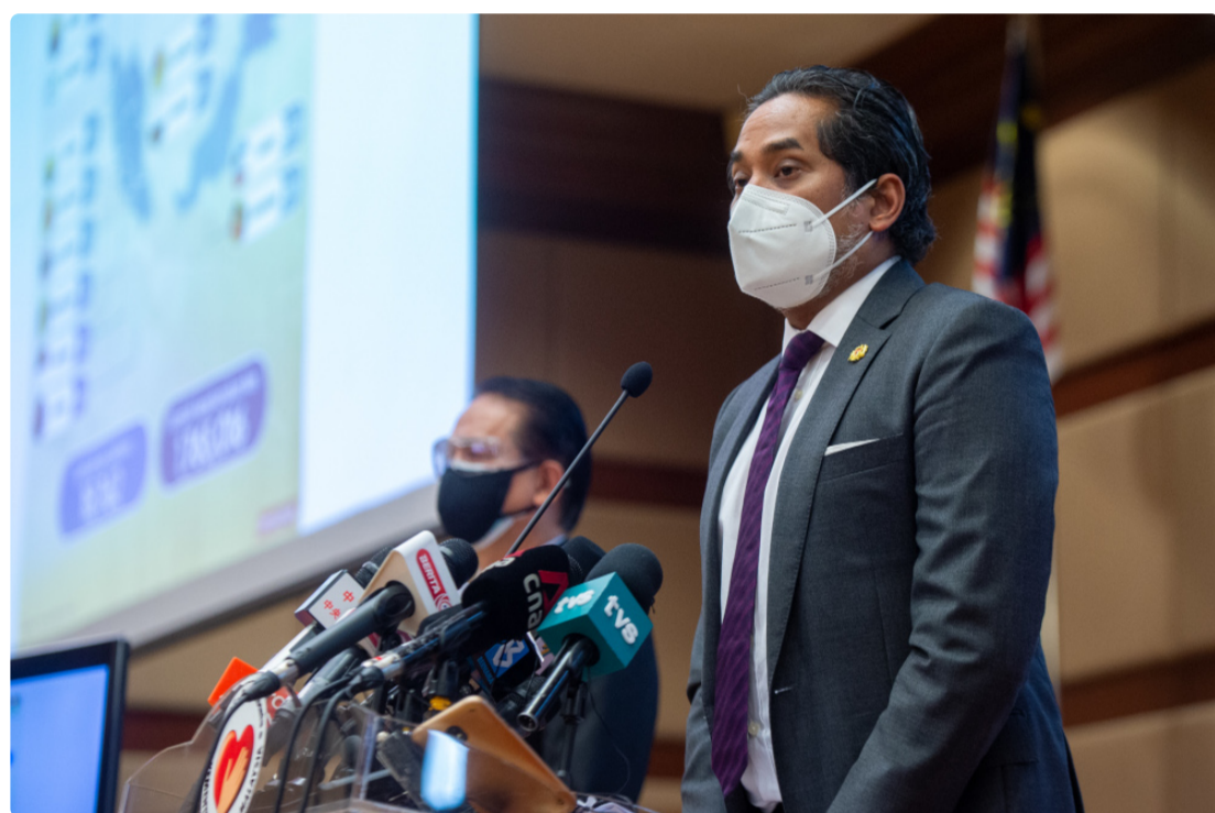
Health Minister Khairy Jamaluddin speaks at a press conference in Putrajaya, September 1, 2021.

Follow us on Instagram and subscribe to our Telegram channel for the latest updates.