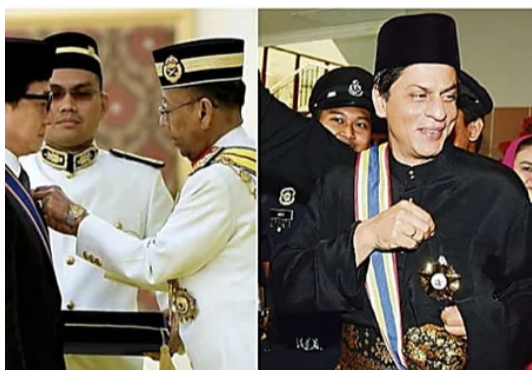
How To Differentiate A Datuk From A Dato? We Explain All The Titles