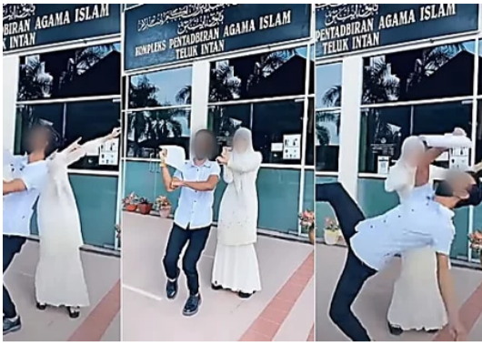
[Watch] Perak Couple Does Happy TikTok Dance After Getting Divorce, But Netizens Are Unhappy About It