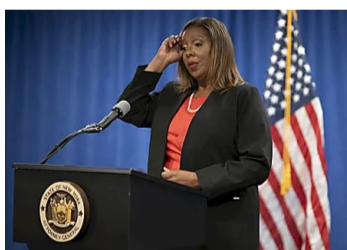
NY attorney general urges end to Donald Trump's bid to thwart her probe