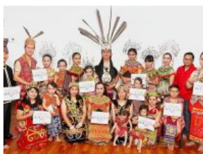
S'wakians to strut their stuff