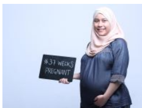
First pregnancy worries