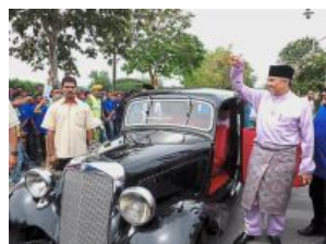
Two Sungai Petani Umno leaders end years-long feud