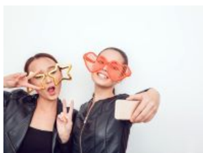
Four types of data users we all know and love - which one are...