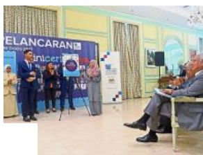
Foundation gives youths hope