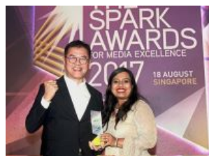
Wonda-ful win for Star Media Group