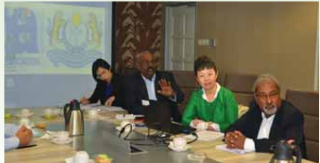
Mesyuarat JK Pengurusan CPD on 27 July 2017