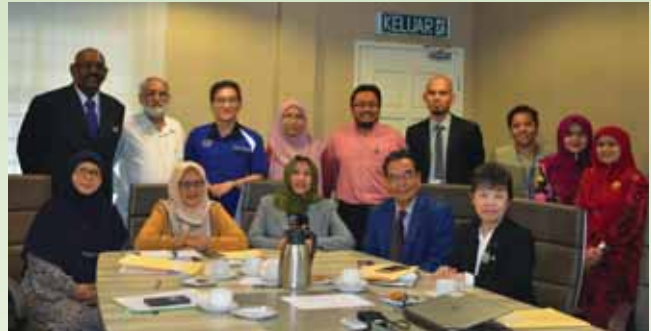
Technical Committee CPD Meeting on 17 July 2017

The three coordinators for APC renewal and NSR are the Malaysian Medical Association for all Non-specialists, the Academy of Medicine Malaysia for Specialists and the MyCPD for all those in the Ministry of Health (MOH). Time and again there are questions like "I am not a member"? Despite having publicised that, it is for all registered medical practitioners and moreover this service is being provided at no expense to all the RMPs. Many have asked me why MMA is giving it complimentary, especially after having spent and still spending an exorbitant sum. The answer is simple "CORPORATE SOCIAL RESPONSIBILITY".