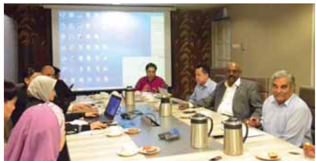
Meeting with Academy of Medicine Malaysia, Malaysian Medical Association and MyCPD on 14 February 2018