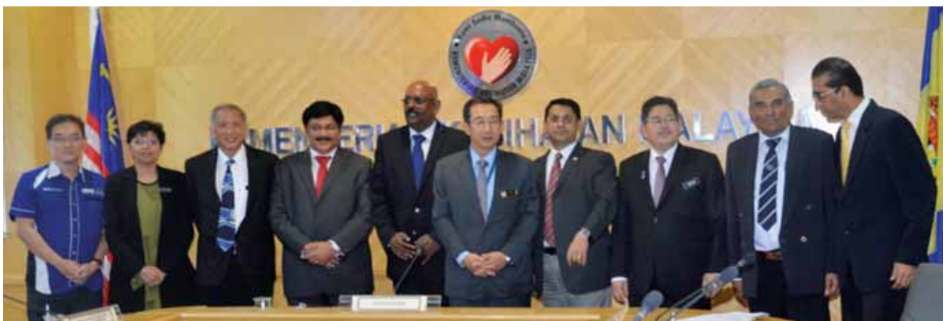
Meeting with KSU on 14 March 2018

We at MMA strongly feel that the GPs and specialists need more representation to voice the diverse and innumerable issues faced by the profession.