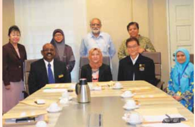
Meeting JK CPD Technical for Non Specialist on 13 March 2018

This is the topic I was given to present at the recent 8 th Annual Scientific Meeting & Regional Update 2018 in Kuantan, Pahang on 18 March 2018. This reminded me of the late John F. Kennedy a former President of the United States of America who once said, "Ask not what the country can do for you, but what you can do for the country". What an appropriate statement. Can I say the same for MMA as to "What you can do for MMA?" I am sure the answer will be a NO. I have been asked on numerous occasions on "What can MMA do for me?" Why should I join the MMA and what are the benefits for ME?