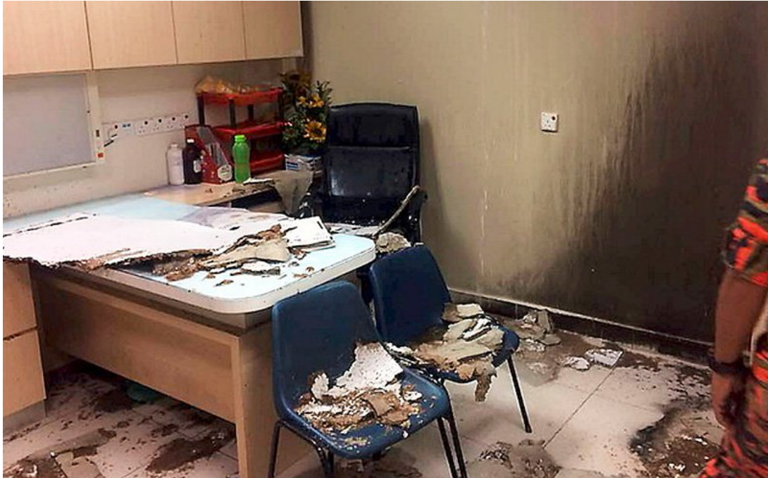
The room in the urology unit of the hospital in Penang where a man poured petrol over himself and a doctor before setting it on fire.

By FMT Reporters - September 8, 2018 11:59 AM