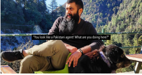
Nov 28, 2015 @ 3:18am Me, My Beard, And The Baffling Ways Others React To It