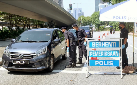
LETTERS Apr 8, 2020 @ 12:28am Don't do it yet