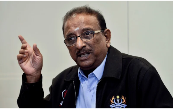
NATION Mar 19, 2020 @ 6:31pm MMA: Take heed of MCO or hospitals will be overwhelmed