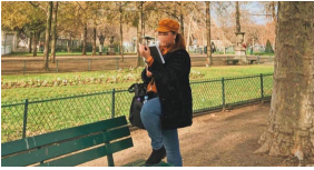
May 23, 2020 @ 7:33pm KL Gym Accused Of Cyberbullying A Woman Shares Their "Side Of The Story"

"Many frontliners had also been offended by this section in the Taska's guidelines/SOP. We do hope the ministry concerned will swiftly address the matter with an appropriate response," he said.