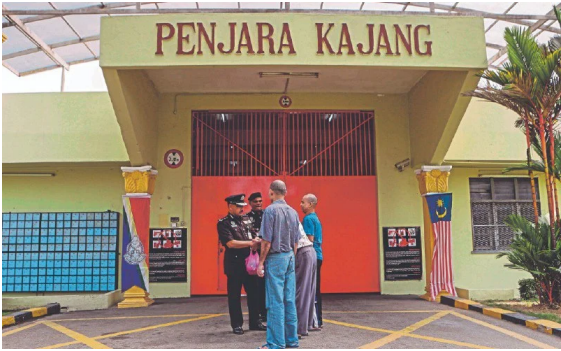
LETTERS Apr 10, 2020 @ 12:04am Don't jail MCO offenders