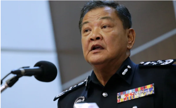
NATION May 10, 2020 @ 10:38pm Don't travel interstate without valid reason, get permission first - IGP