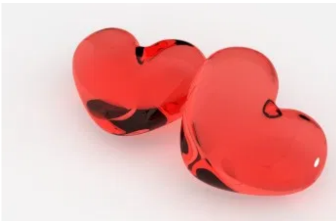
( https://codeblue.galencentre.org/2019/11/07/moh-to-reorganise-organ-and-tissue-procurement-services/ )

Countries Need To Protect Fruits Of Investment And Industry 4.0 ( https://codeblue.galencentre.org/2019/10/10/countries-need-to-protect-fruits-of-investment-and-industry-4-0/ )