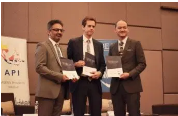
( https://codeblue.galencentre.org/2019/10/10/countries-need-to-protect-fruits-of-investment-and-industry-4-0/ )

(http text: 1992 http priv clin rm6 for- work wor anti anti test doct doct