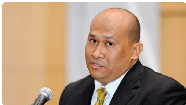
Tuesday, April 27, 2021 Malaysia needs policy review on declining foreign interest