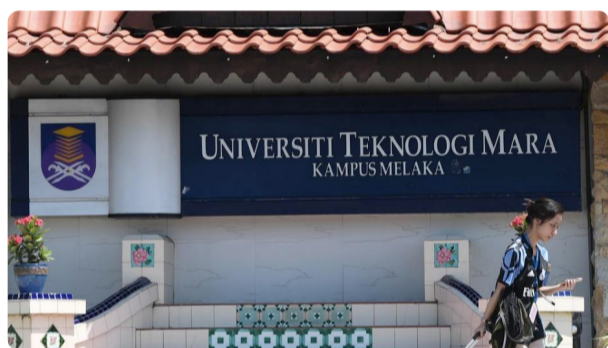
Thursday, October 22, 2020 UiTM postpones convocation by appointment to Dec 1