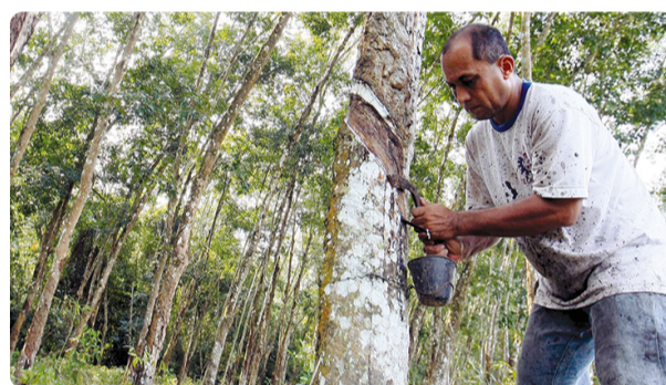
Tuesday, June 9, 2020 Rubber demand growth to turn positive in June