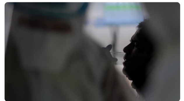
Sunday, September 27, 2020 COVID-19: 150 new cases, one more fatality – Health DG