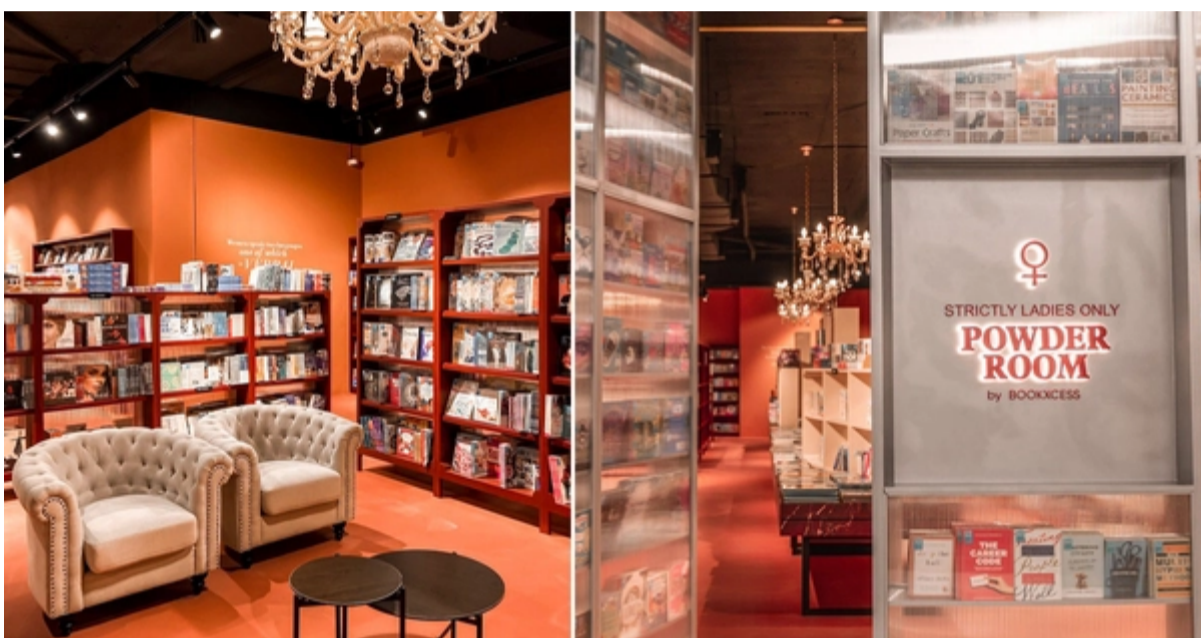
This KL Mall Has A Women-Only 'Powder Room' If You Need A Break From Men