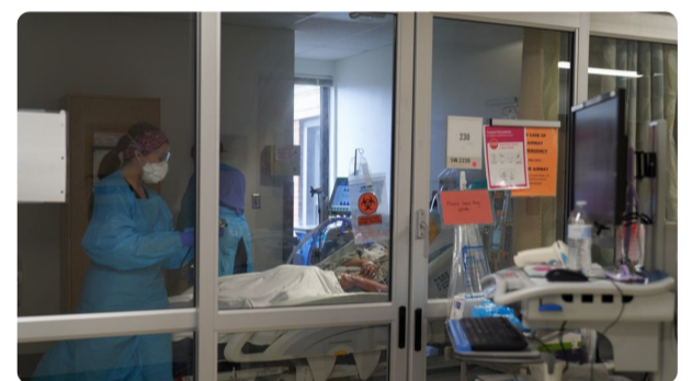
Wednesday, December 29, 2021 World Hits Record Daily Covid Cases as Omicron Mars Christmas