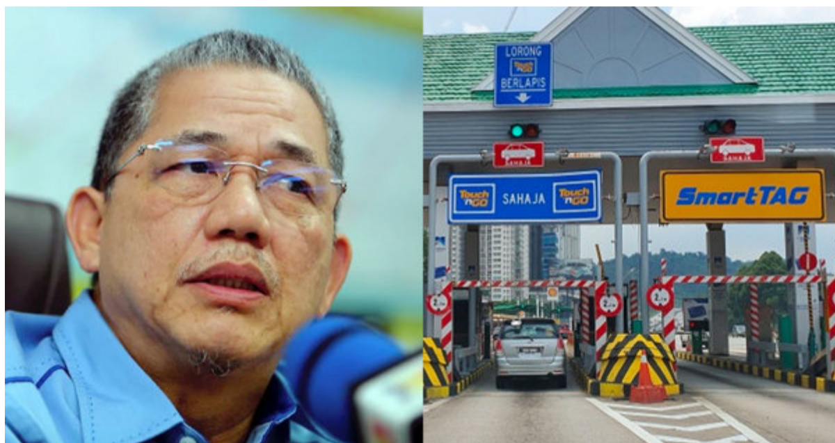
No More TNG Monopoly: Highway Users Will Be Able To Pay Toll With Any E-Wallets Soon