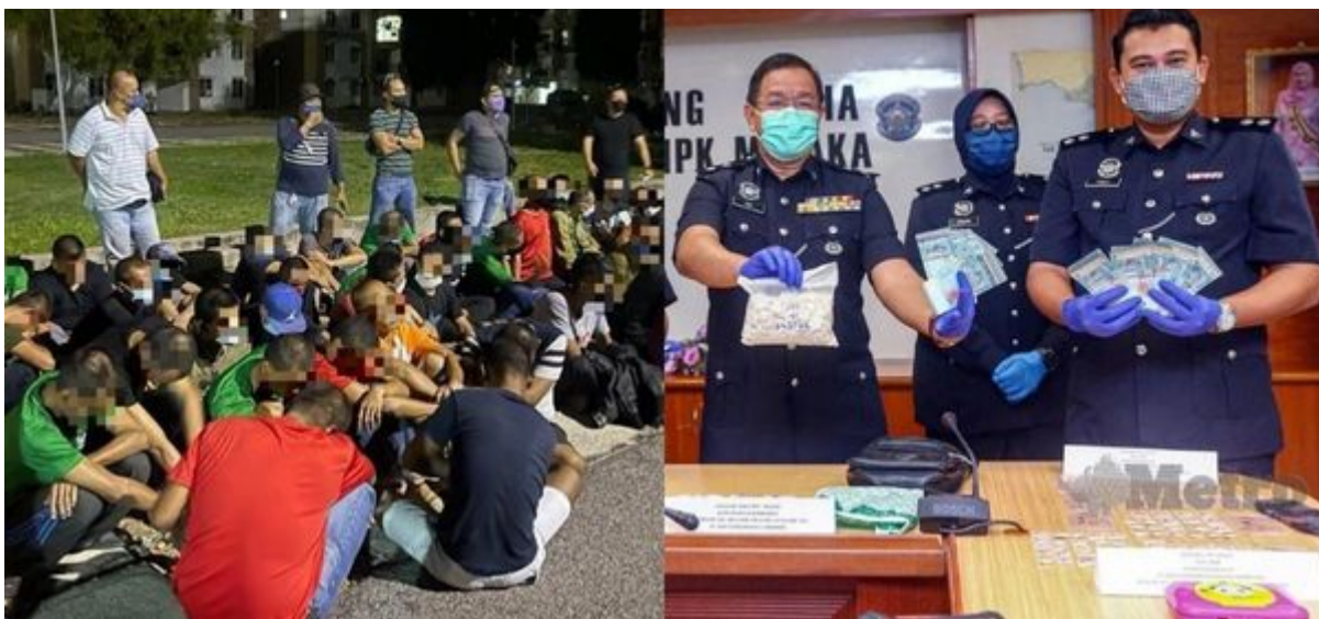
3-Day Drug Den Crackdown Sees Over 5,200 Arrested Including Dozens Of Teen Drug Peddlers