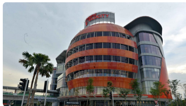
Tuesday, March 24, 2020 Mall operators urged to offer rebates to tenants