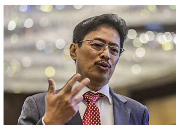
Report: Woman sued for defamation by MACC chief formally replies in...