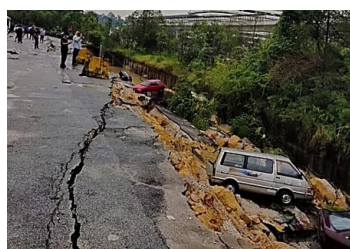
Subang Jaya council tells 17 businesses in Seri Kembangan to...