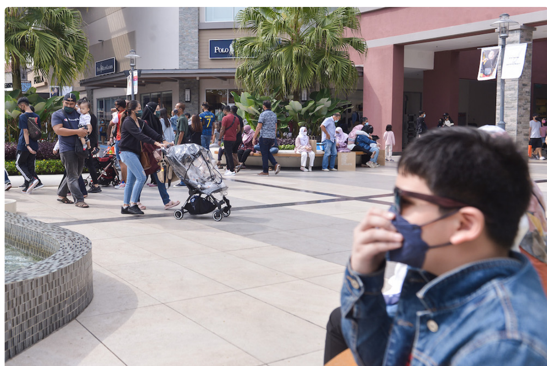
People spend time shopping with their families at the Genting Premium Outlet shopping mall in Genting Highlands on October 16, 2021.

Thursday, 21 Oct 2021 04:55 AM MYT BY YISWAREE PALANSAMY