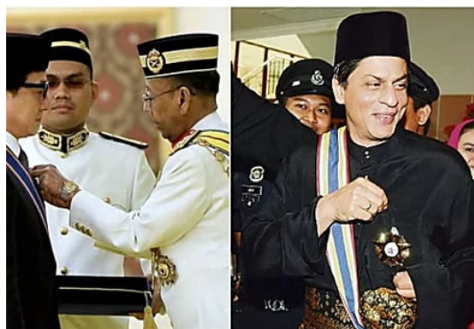
How To Differentiate A Datuk From A Dato'? We Explain All The Titles