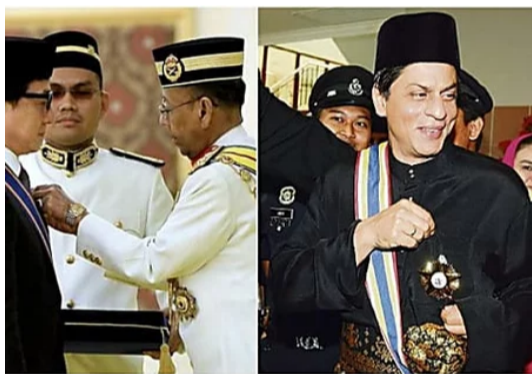
How To Differentiate A Datuk From A Dato'? We Explain All The Titles