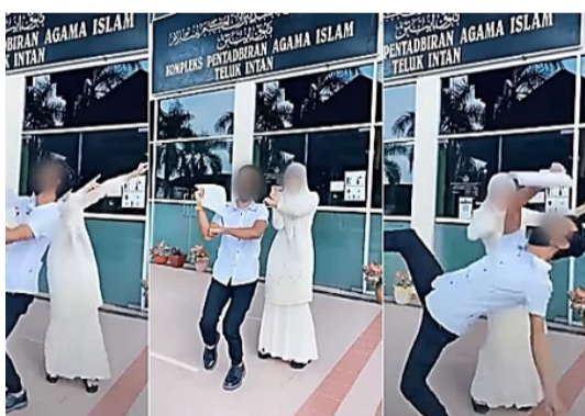
[Watch] Perak Couple Does Happy TikTok Dance After Getting Divorce, But Netizens Are Unhappy About It