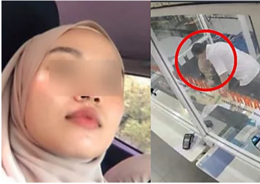
Rakan Sekerja Cium Kepala, Hulur Wang Tunai RM50 Sebab Rasa 'Bersalah'