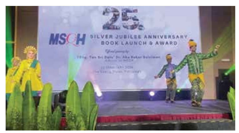
MSQH 25th Anniversary celebration

Let me start on sharing about the 25th anniversary of Malaysian Society for Quality in Health (MSQH) which fell on 17 October 2023, but was celebrated at the Everly Hotel, Putrajaya on 22 February 2024.