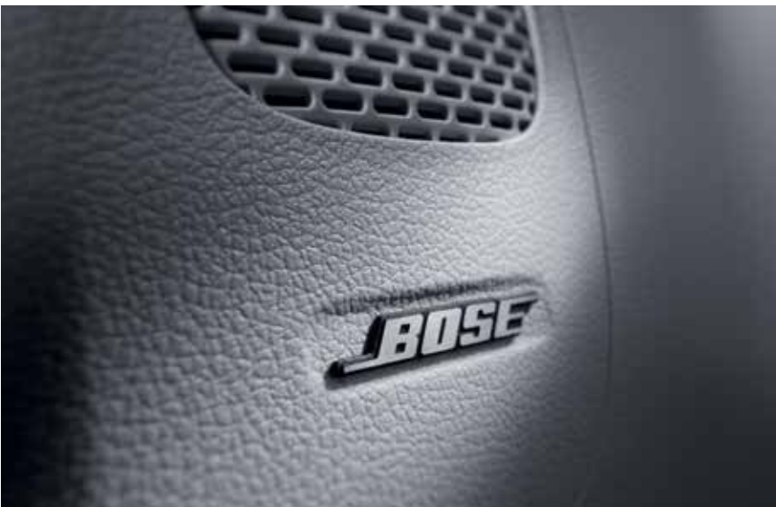
BOSE Premium Sound System