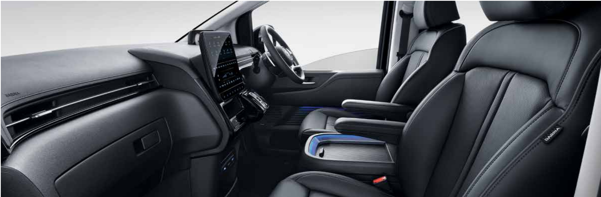
Black Mono + Pattern Insert Film (NNB)