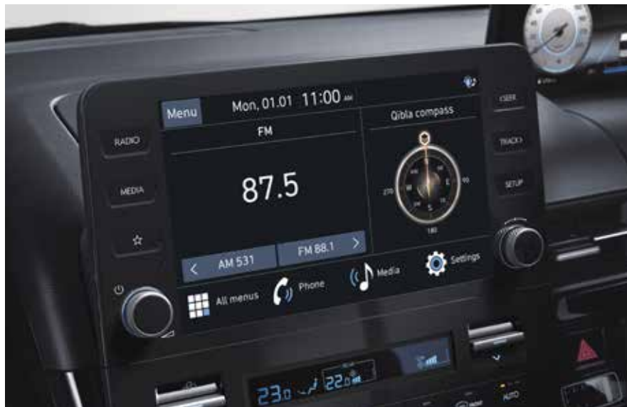
8-inch Display Audio