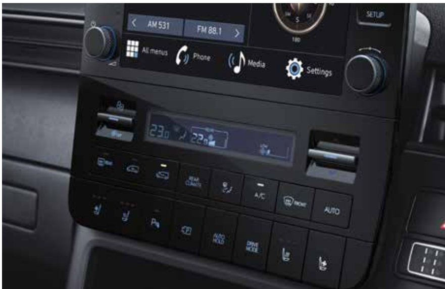
Full-auto Air Conditioning System