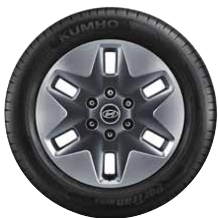
18" Alloy Wheels 10-Seater Prestige