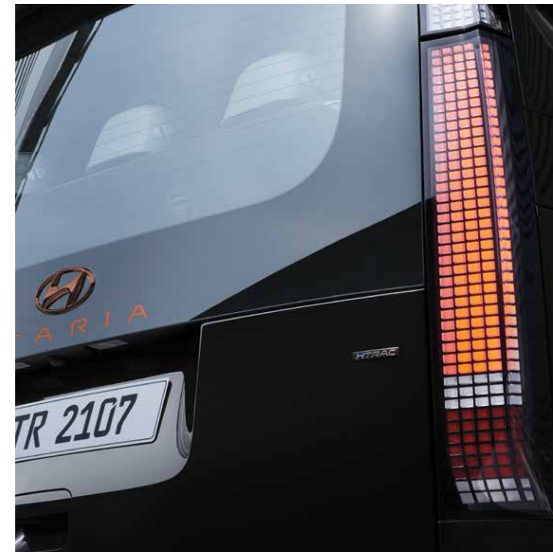
Parametric pixel lights (LED rear combination lamp) / Tinted brass chrome