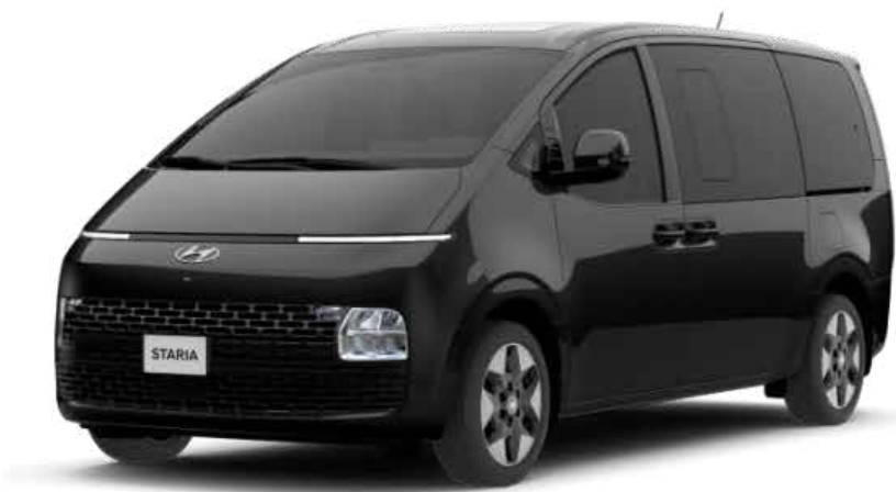
Abyss Black Pearl (A2B)