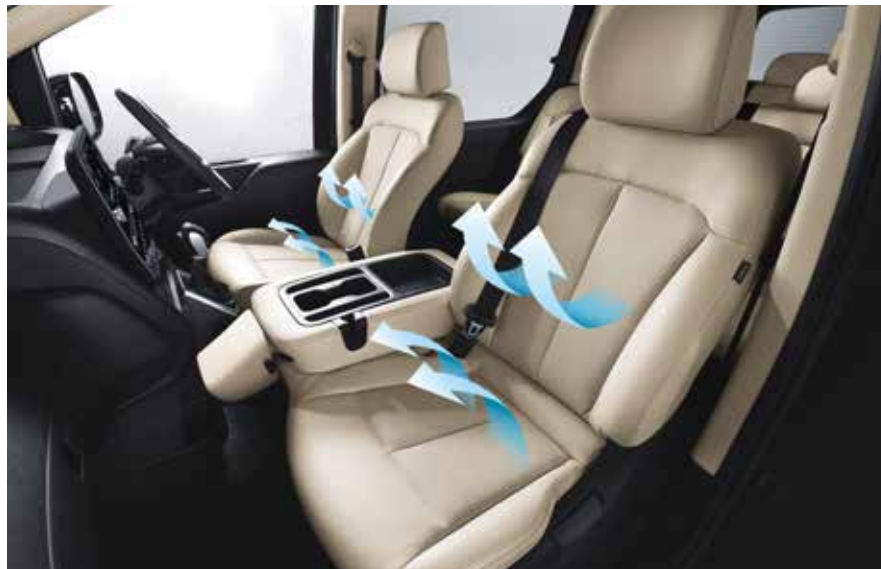
1st-row Ventilated Seat