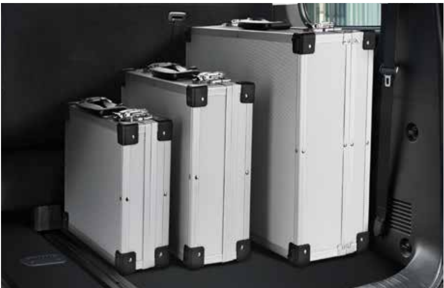
1,024L Boot Capacity