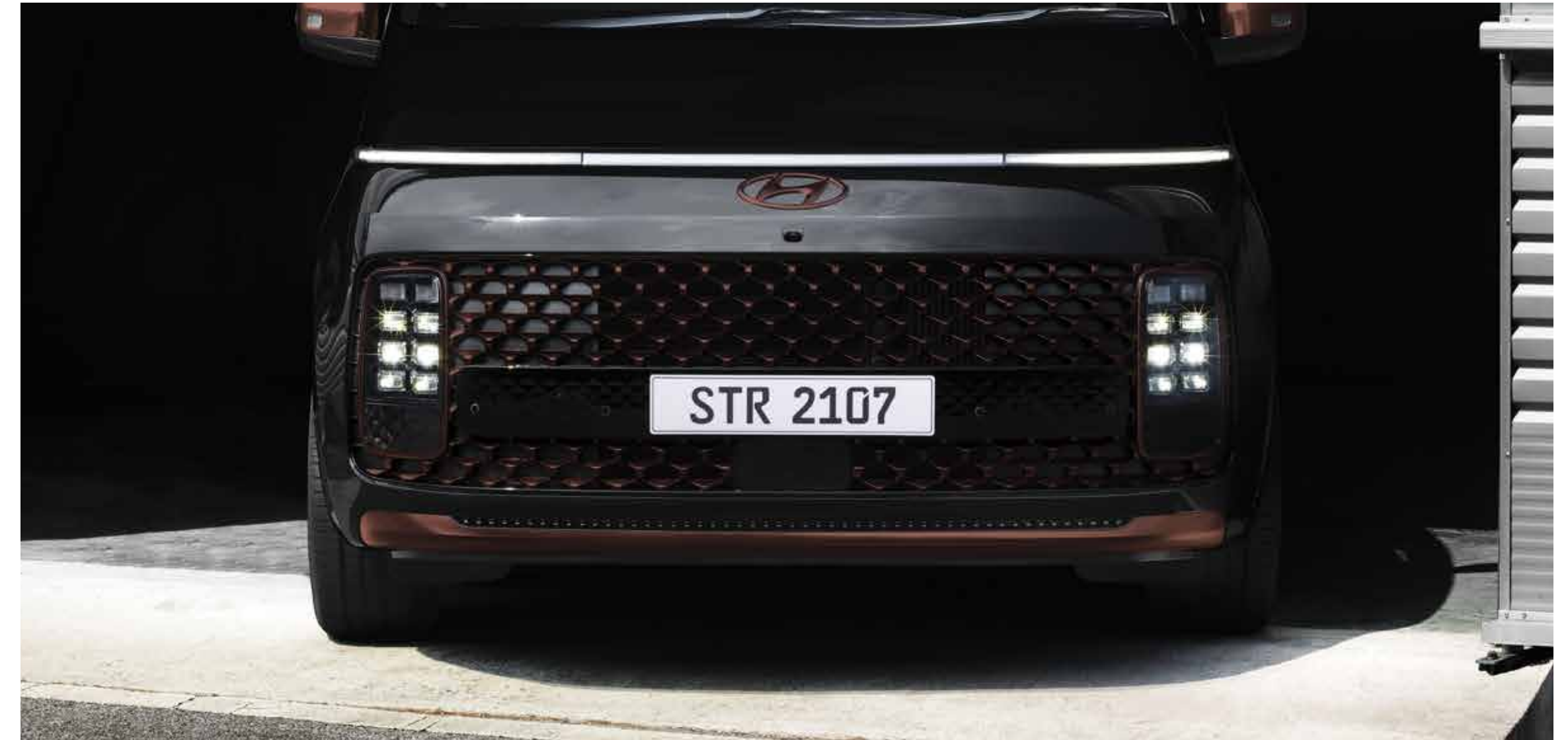
Full LED headlamps / Tinted brass chrome

With a simple yet classy visage that exudes bold elegance, STARIA drives MPV design towards a new, revolutionary direction. The futuristic motifs in its look also allude to its top-of-the-line systems that make the STARIA a more comfortable and safer ride.