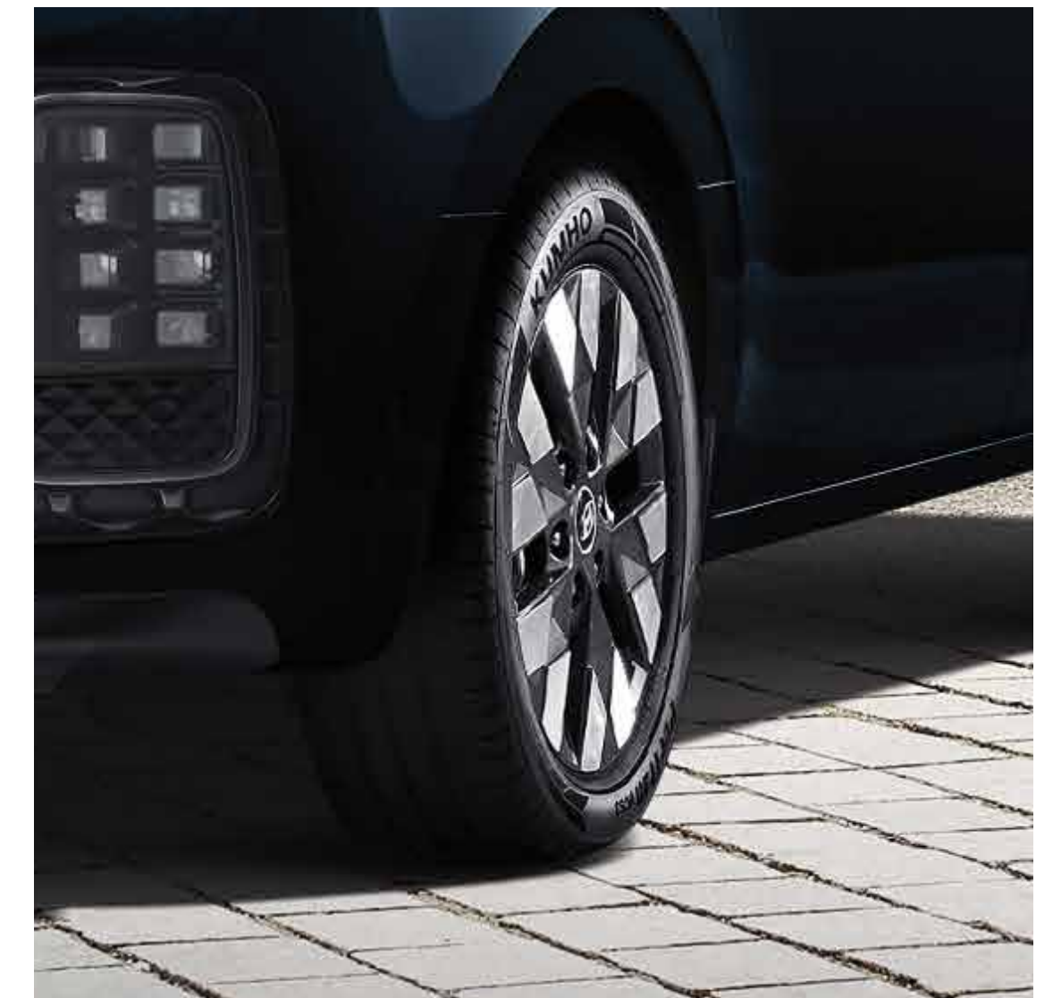
18" Tinted Dark Chrome Alloy Wheels