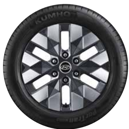
18" Tinted Dark Chrome Alloy Wheels 7-Seater Prestige