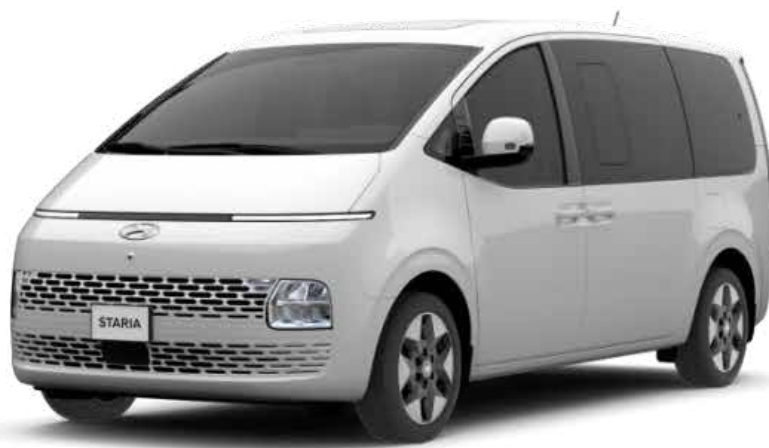
Creamy White (YAC)