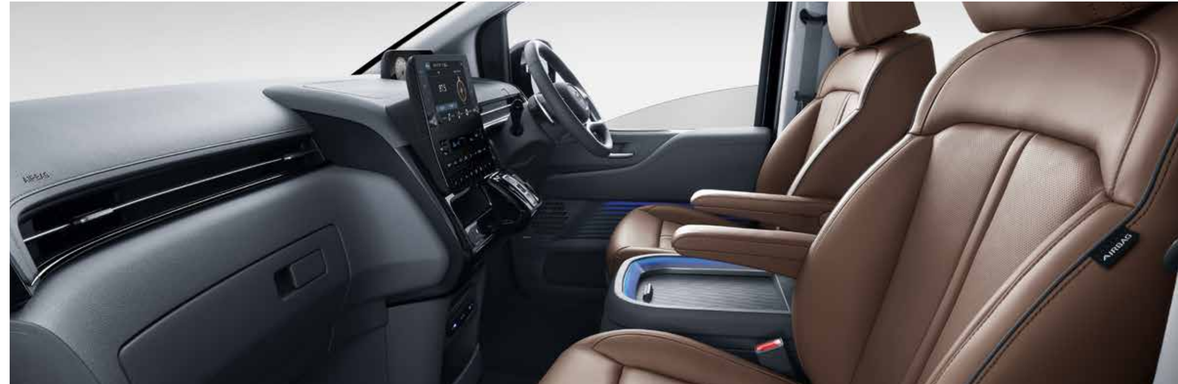
Gray + Brown 2-Tone (SIT) Only for 7-Seater Prestige.