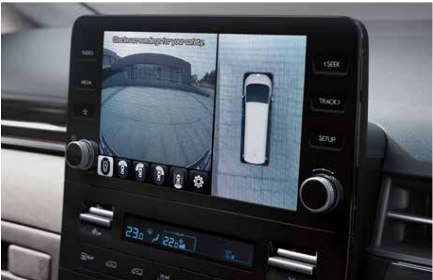
Surround View Monitor (SVM)