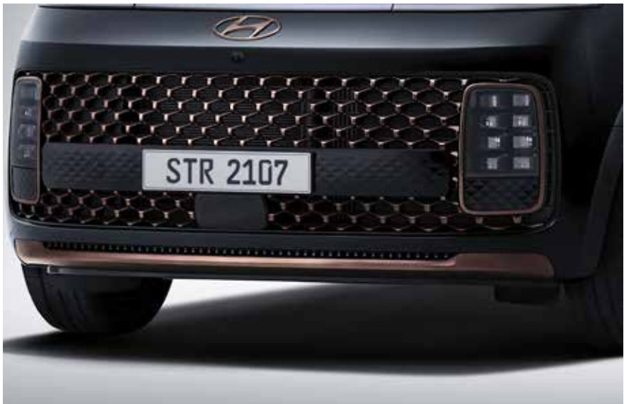
Tinted Brass Chrome Bumper