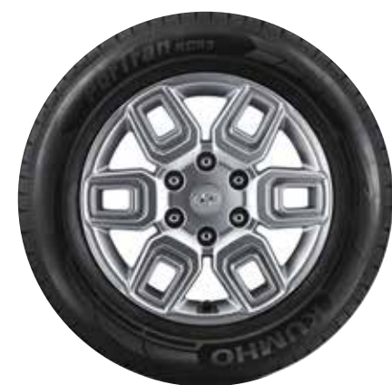
17" Alloy Wheels 10-Seater Style & Prime