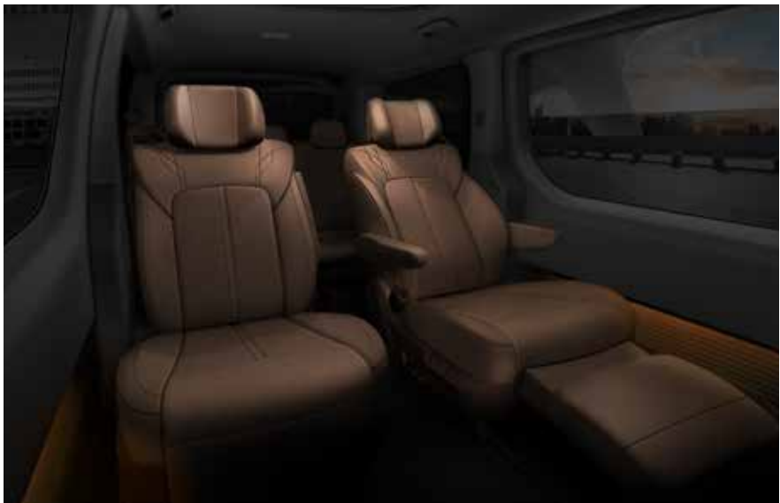
Premium Relaxation Seat Only for 7-Seater.