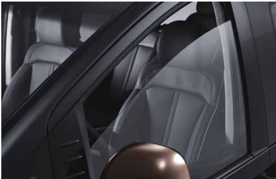
1st-row Double-laminated Soundproof Glass