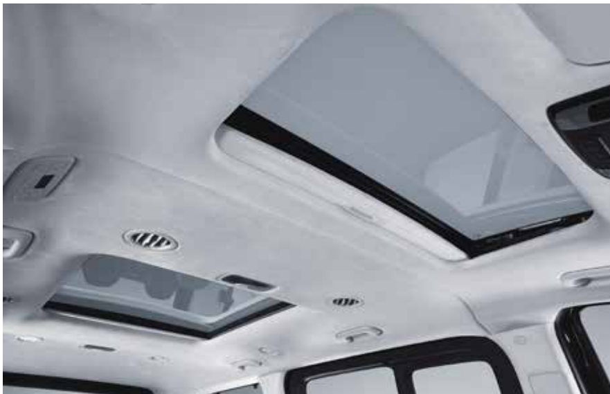
Dual Sunroof Only for 7-Seater.