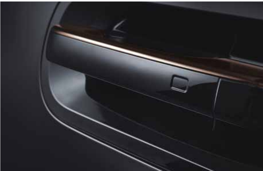
Push Button Door Handle