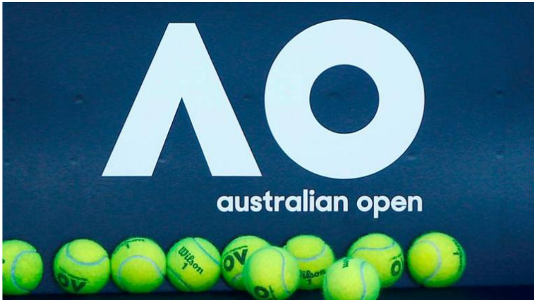
Medvedev faces Auger-Aliassime in Australian Open quarters