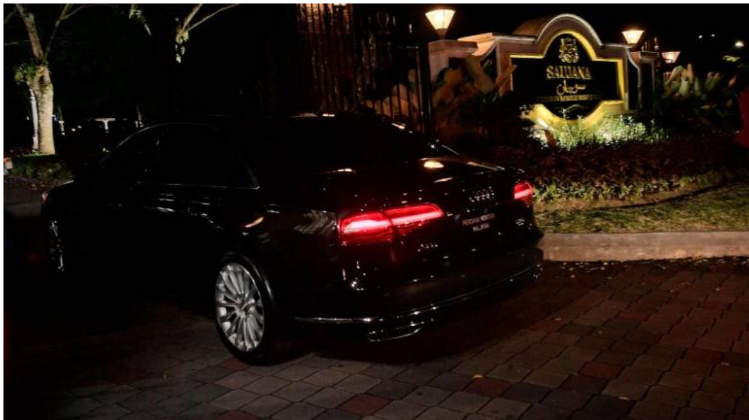
PM attends meeting with Umno president, Johor Umno political bureau