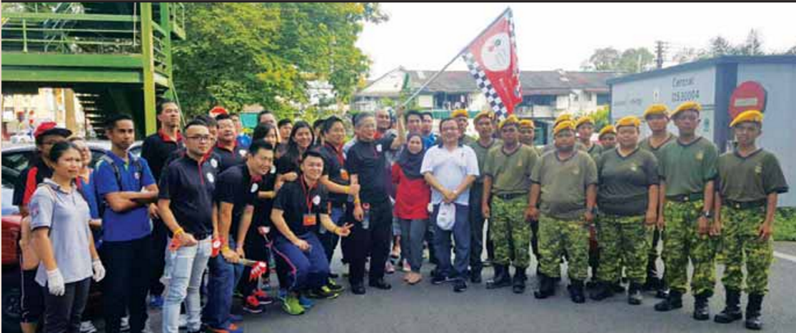
Allied Against Dengue (AAD) campaign, Sib